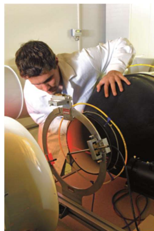
Fig.3: E+E Elektronik, Austria