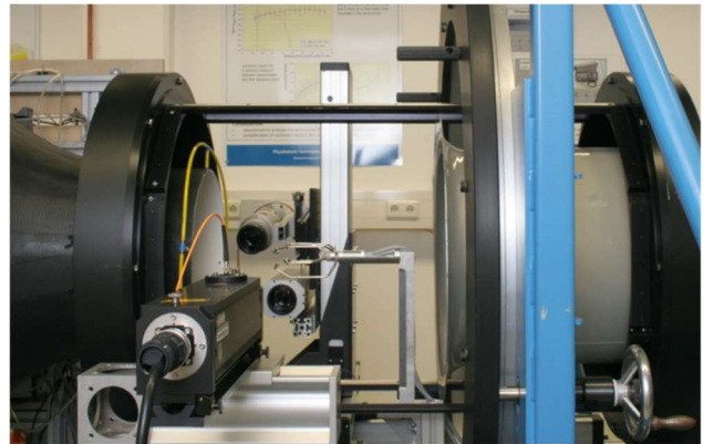
Fig.2: Sensor calibration with ILA LDV System at PTB (NMI Germany)