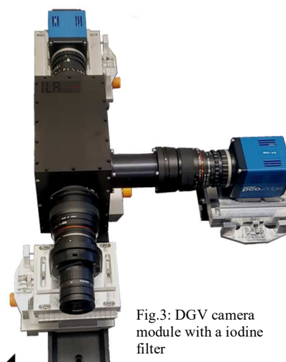
Fig.3: DGV camera module with an iodine filter

The ILA R&D DGV system consists of the high power laser source, a wavemeter, lightsheet optics, the DGV camera module (as seen in fig. 3), the INDIO Controller and a DGV PC. All hardware signals come together in the INDIO Controller, which controls i.a. the wavelength, light sheet, laser power and iodine cell temperature. The hardware signals are incorporated in the ARES-Software which offers a comprehensible design, full control of all settings and easy-to-follow steps that are necessary for performing measurements (bottom right corner in figure)